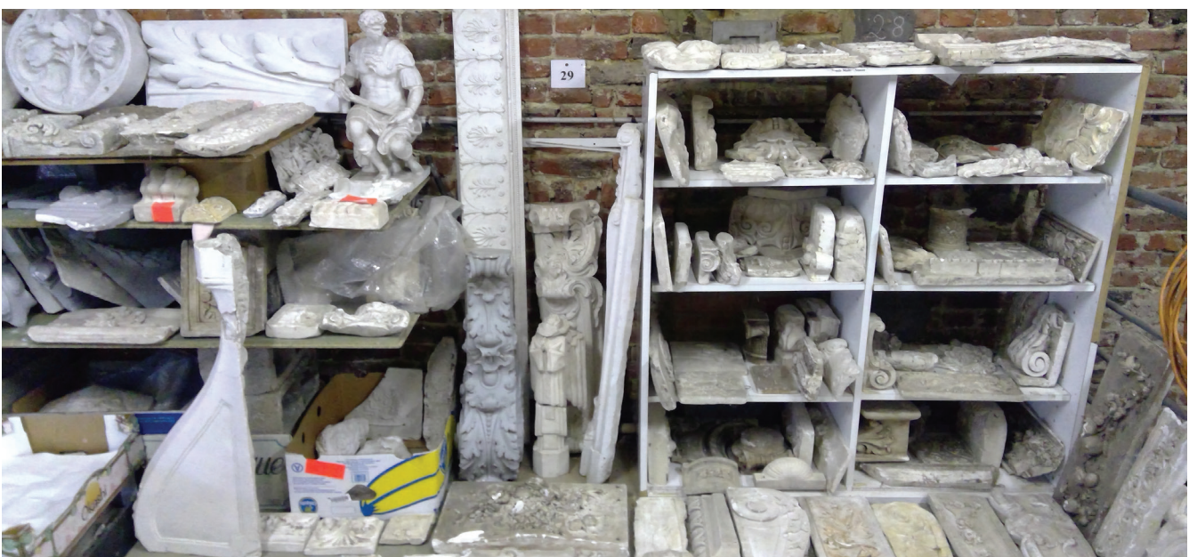
Figure 7.- The collection.