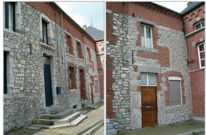
Figures 1 y 2.- Private house described as marble workshop on a map of 1753. The door lintel mentions the date of 1751.

In the mid of the 18th century, five active marble workshops were concentrated in only one street. So far, no archive document gave information on the production performed at Rance. For the end of the 18 th century, we were more fortunate because we were able to obtain a register which allows us to glimpse the production of pieces from 1770 to 1784. The document does not mention the names of the marble workshops but depending on the number of pieces, it must be a grouped production. For example: from 1770 to 1771: 3 altars, 171 pieces of chimney with different designations such as «communes, plates à tête et à raccord, à la grecque, à la flamande, capucines, avec rosaces, milieu guirlandes, motifs», different kind of tables: «à tombeau, pour pieds dorés, écriitoires, mortiers». From 1772 to 1773: 4 altars, 366 pieces of chimney and several tables, decorative coverings for walls, stairs... [Figures 1-2].