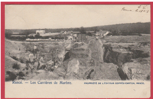
Figure 3.- Quarry called «Trou de Versailles».

Taken over by the Grimée-Baily family and successors, it remained equipped to continue producing traditional works. We know that this workshop produced many pieces of chimney and remarkable masterpieces of art work and decorations of all kinds (Ducarme 1957). The hinge between the 19 th and the 20 th centuries saw a feverish marble activity. The 20 th century showed the gradual closure of quarries [Figure 3] and most of the workshops. The 1914-18 war, the crisis of 1930 and, a few years later, the Second World War seriously endangered the local industry. The last quarry closed in 1950 and only one workshop survived until 1980. All traces of this activity disappeared, the only witness that allows us not to forget that this small village held a prominent place in the monumental and artistic production of marble objects, is the museum and the many architectural witnesses still visible today in its streets.