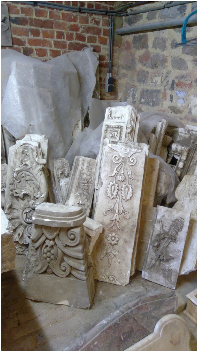
Figure 9.- The collection.