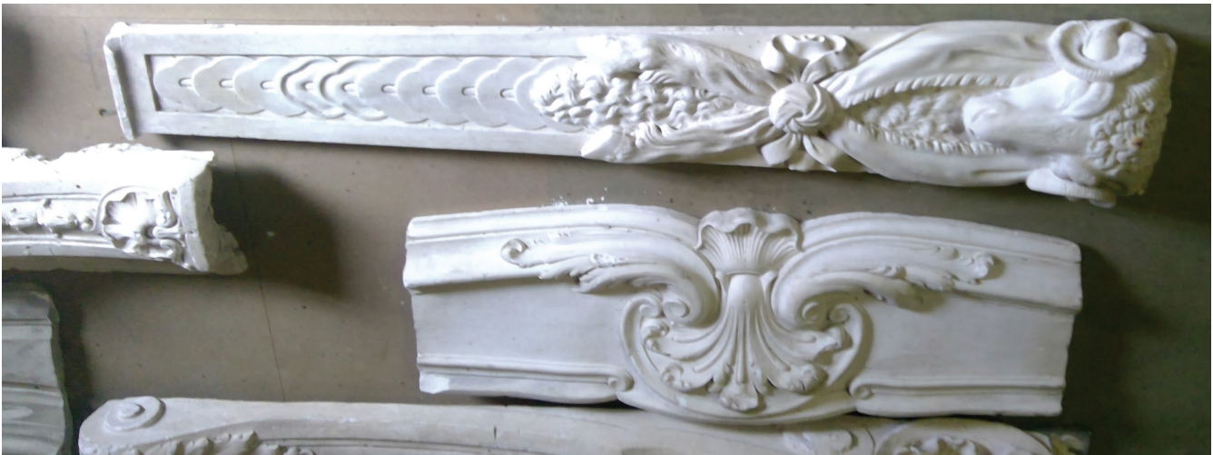
Figure 6.- The collection.

environment that was not always suitable. The first job was dusting, sorting, taking the pictures ... and at the same time, it was a real opportunity to create a gallery of plaster casts (a «gypsotheque») in a new space in the museum, with the most beautiful models. The entire collection shows pieces of all sizes and a large range of decors. This set is a fund of great diversity and very rich by their aesthetic and technical qualities. The inventory process put in place is divided into several sections and a working method for researching “twin” works will be organized as soon as the census is completed. Several plasters show traces of rust, they come from reinforcement of iron placed in the structure of the plaster. Others are damaged by accumulation of dust in the interstices of the decorative elements or by sometimes very large breaks. Some elements are also missing due to poor storage ... The aim of the restoration is to treat the many damages while maintaining the aesthetics of the items and this work asks the intervention of a professional as well as the creation, in the museum, of a storage space adapted to the conservation of this heritage.