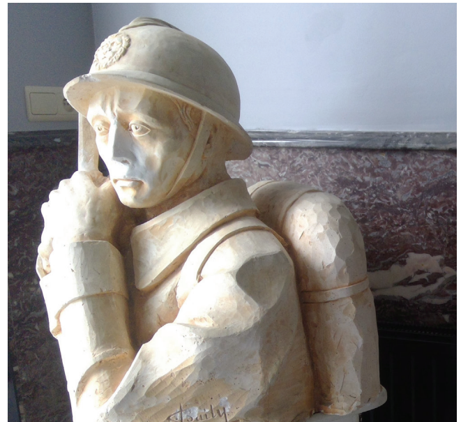
Figure 10.- The collection. Created by R. Baily (1933).