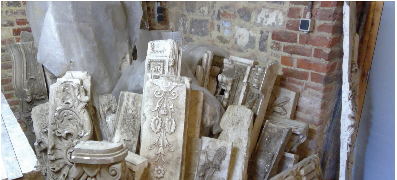
Figure 8.- The collection.