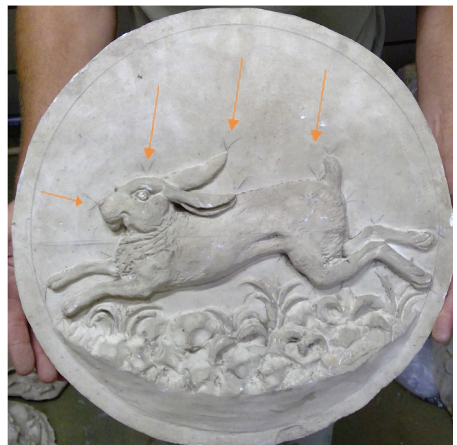
Figure 5.- Traces of «mise aux points» let by the pantograph.

We know that as early as the 19 th century, casting workshops were devoted to the reproduction of original works. These casts were exchanged between museums to complete archaeological collections presented to the public and to allow the study and comparison of objects. In Belgium, the plaster casting workshop of the Royal Museums of Art and History is located in Bruxelles. It houses and runs a collection of 4.000 casts of works of art. The casts are made by specialist craftsmen who employ traditional techniques. They propose also the selling of plaster. Even if this aspect of "casting" or "copy" was considered when the many plasters were transferred to the museum, the idea was quickly abandoned because the context of the storage of these plasters shows that it is an own and specific production linked to the creation of marble sculptures. The traces of « mise aux points » left on most plasters allow this conclusion even if some elements could be casts on monuments or various sculptures [Figure 5]. The lack of documents related to this collection suggests that the workshop kept the plaster models in this shelter without listing or inventory. A question also arises on the purpose