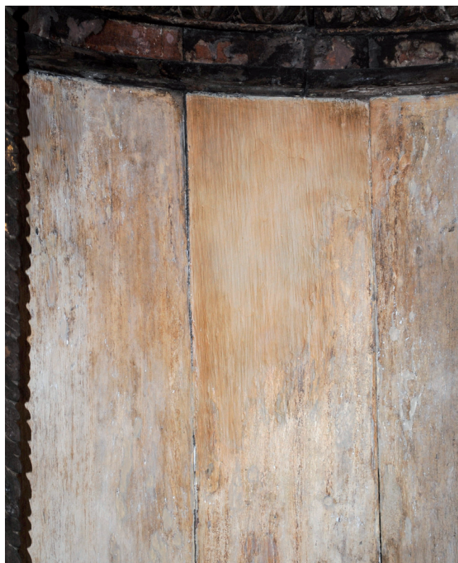
Figure 6.- Central niche during chromatic integration with acrylic paint of the filling paste.

The filling materials on the white areas' lacunae were concealed using both the trattegio and the chromatic selection. The combination of both techniques consists in the application of vertical lines - overlapped and juxtaposed - over a base ton (Bailão, 2011: 55). The pigments (Sennelier® and Kremer®) were agglutinated in an acrylic medium (Liquitex® Glazing Medium), and mixed directly on the palette. Through these two techniques combined, it was possible to achieve a chromatic vibration, colour depth, and saturation similar to the original, but still distinguish the intervened areas [Image 6].