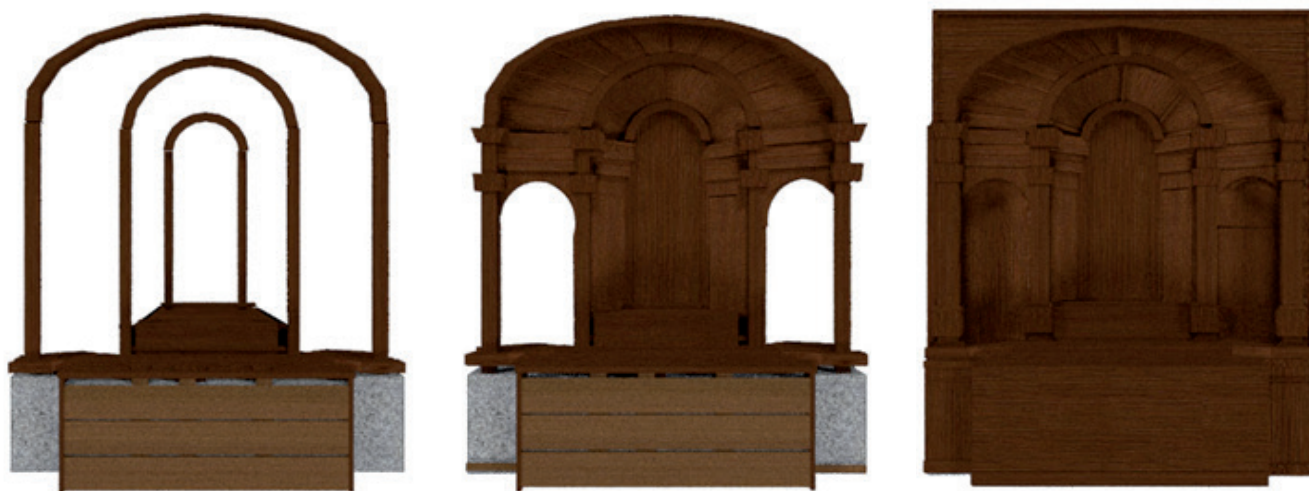
Figure 2. - Three-dimensional model representing the construction process of the retable. Created with the software Autodesk Maya ; a) Arches' placing; b) Wooden boards nailed from the centre out; c) Wood structure's final appearance. 3D modelling by Patrícia Monteiro.

Through the various analysis, studies and observation it became possible to identify the materials used in the execution process of Our Lady of Mercy's retable.