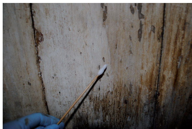
Figure 5.- Removal of the acrylic resin using both saturated and aromatic hydrocarbon solvents.

To remove the inappropriate chromatic reintegration and the acrylic resin deposits, from previous interventions [Image 5], various solvents were used, such as Shellsol® A, Shellsol® D40, 96% ethanol.