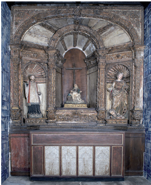
Figure 1.- The retable in the chapel of Our Lady of Mercy before the conservation treatment.

The chapel of Our Lady of Mercy was first named in honour of Saint Catherine in the 17th century (Afonso et al, 2005) and at the time it was used for funerary and devotional purposes (Pereira, 1995, vol. I, p. 386). The blue and white tile panels (1738), made by António Vital Rifarto (Gonçalves, 1972: 262), represent Saint Catherine of Alexandria on the right side and possibly Saint Cajetan on the opposing wall. During the altarpiece's disassembling it