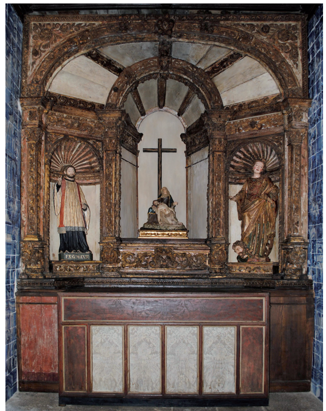
Figure 7.- The retable of Our Lady of Mercy after the conservation treatment.

Finally, the surface sheen was corrected by applying a new layer of the previously mentioned protection coat composed of acrylic resin dissolved in a saturated hydrocarbon solvent (5% Paraloid® B72 in Shellsol® A) [Image 7].